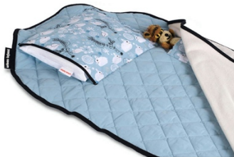
Urban Infant Brand